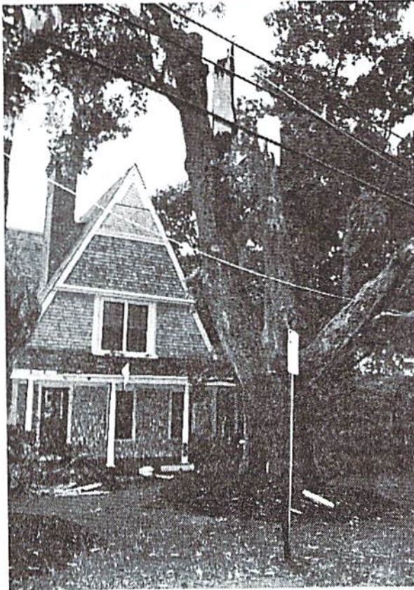
A tree down on Standish St. that caused a major inconvenience to residents. Electricity was also out for 4 hours.